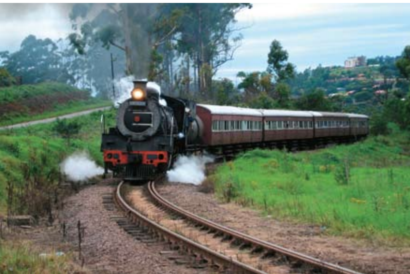
Above: The Umgeni Steam Railway, A throwback to the colonial times.