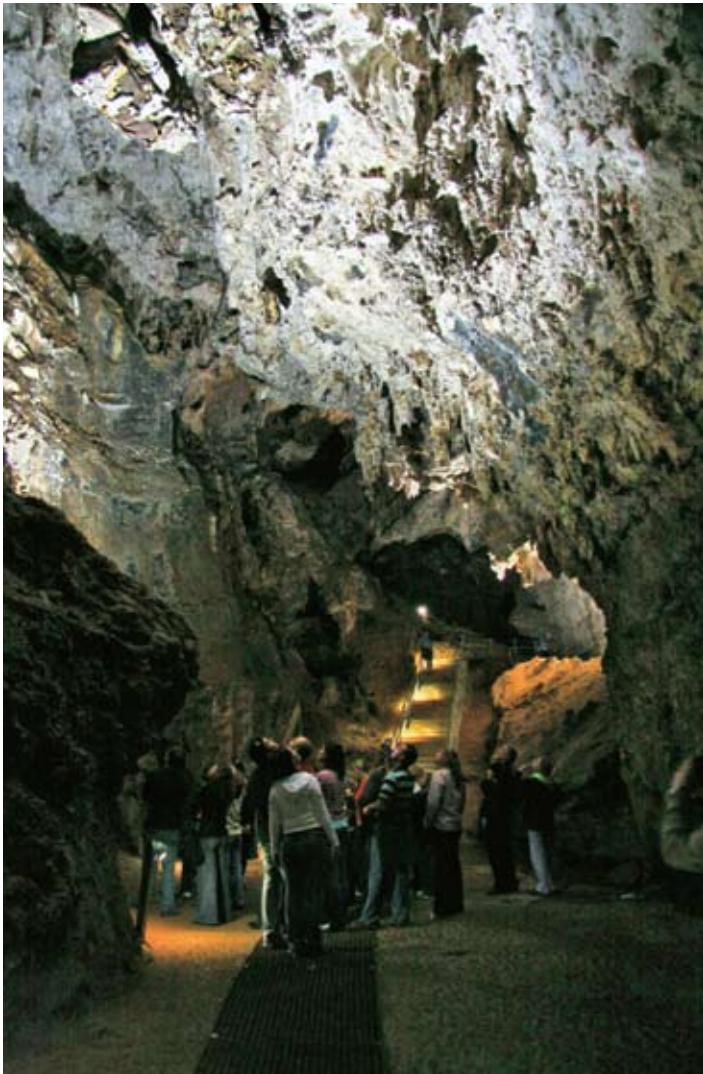
Above: The tours at the Sterkfontein Caves give detailed information on finds such as Mrs Ples, the Taung Child and Little Foot.

Maropeng charts the beginnings of Earth and the history of humankind in a way that will make kids keen to learn.