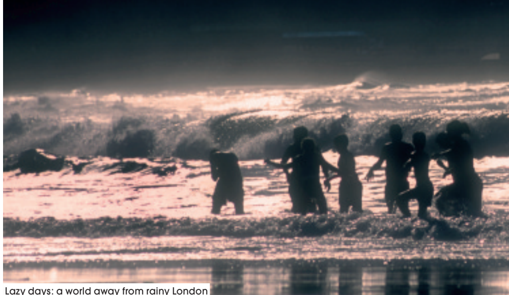
Lazy days: a world away from rainy London

You'll likely have a beach to yourself in winter, but if the weather doesn't co-operate you can enjoy myriad monasteries, churches and castles. Even the party-hard resorts of Ayia Napa and Paphos are lined with monuments and museums. As an added bonus, you can ski down Mount Olympus from January.