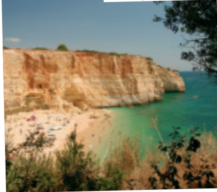
Warm up in the Algarve